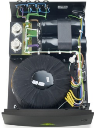
HiCap DR internals